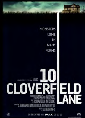
10 CLOVERFIELD LANE Budget $14M Gross $110M