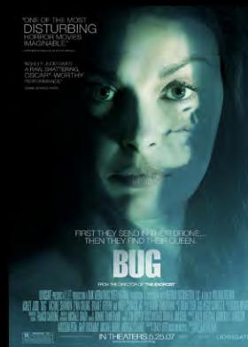
BUG Budget $4M Gross $8M