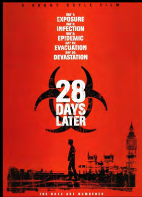
28 DAYS LATER Budget $8M Gross $84M