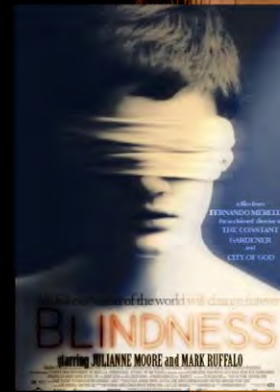
BLINDNESS Budget $16M Gross $44M