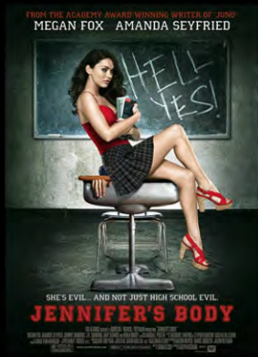
JENNIFER'S BODY Budget $16M Gross $31M