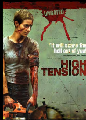
HIGH TENSION Budget $2.5M Gross $6M